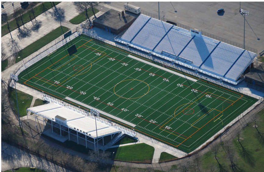
Aerial view of Gately Stadium

Gately Stadium 810 E 103RD St Chicago, IL 60628